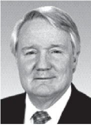
CONGRESSMAN JOHN BRYANT CHAIRMAN OF THE BOARD

"Education is the most powerful weapon which we can use to change the world."